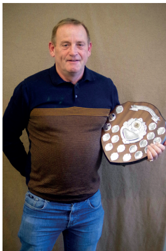
ADULT SPORTS PERSONALITY David Burnsidess